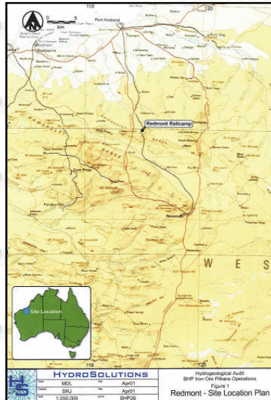
Map courtesy of DoLA