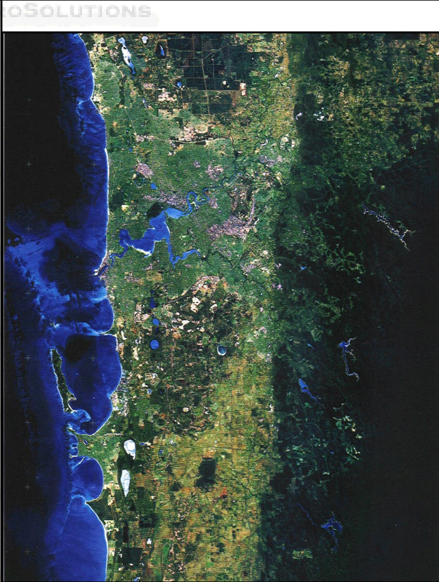
Aerial photograph