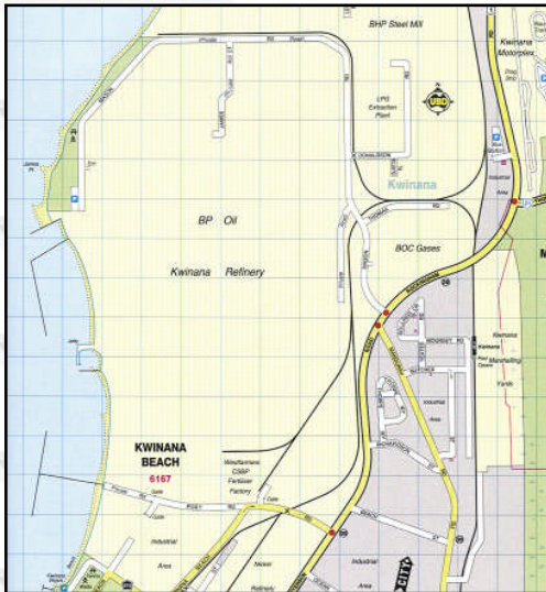
Basemap courtesy of UBD