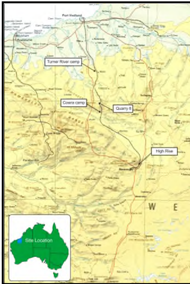
Part map